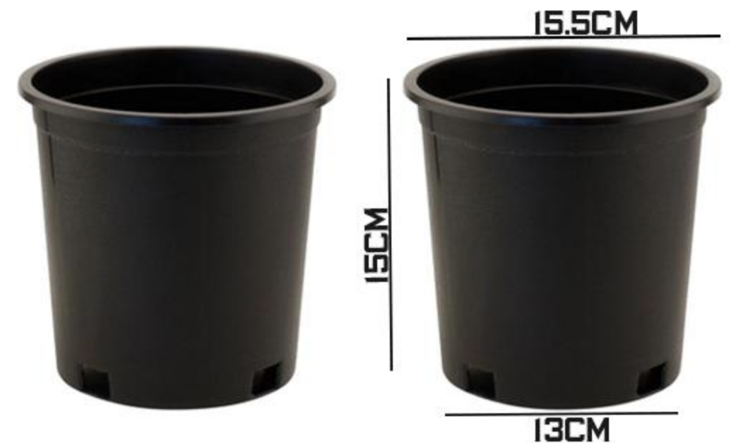
MODEL -: 13 COLOR -: BLACK