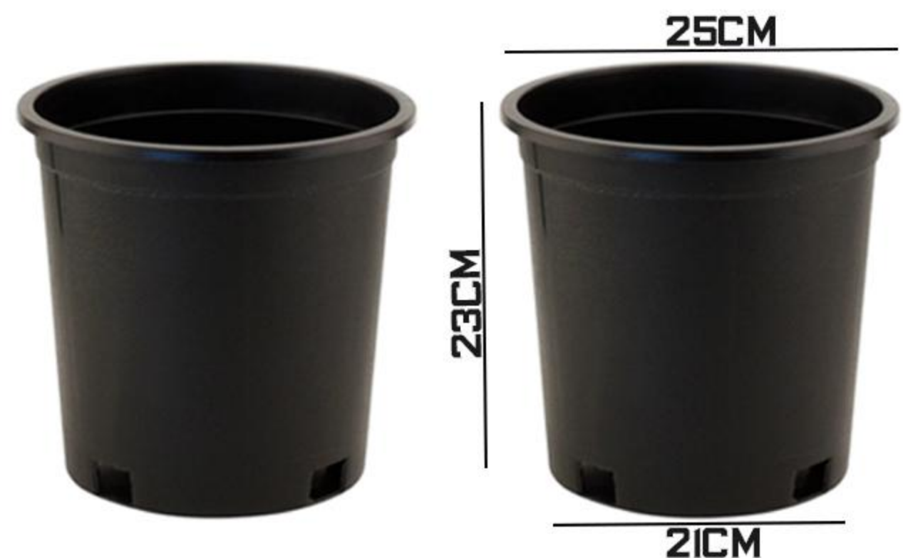
MODEL -: 21 COLOR -: BLACK