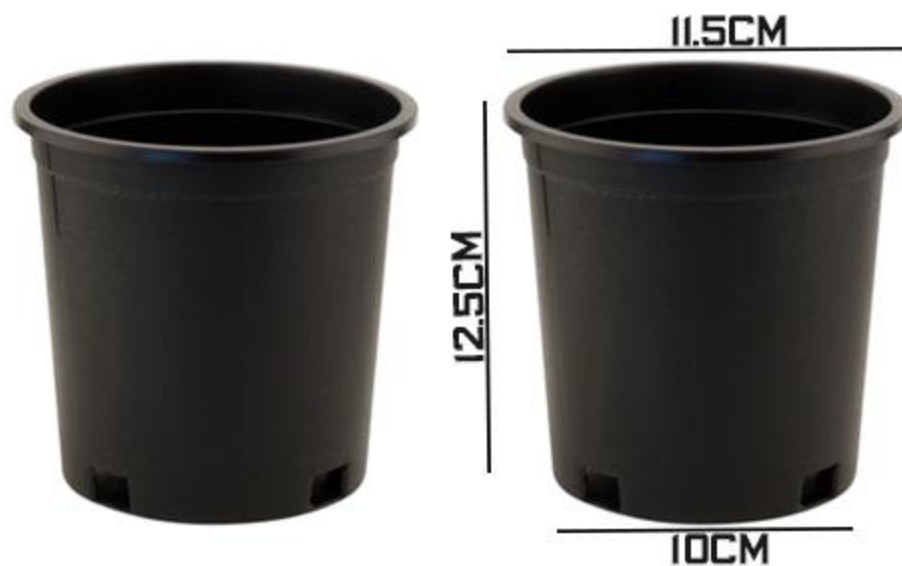
MODEL -: 10 COLOR -: BLACK

MADE FROM THICKENED SOFT PLASTIC, THESE 1 GALLON NURSERY POTS ARE LIGHTWEIGHT, REUSABLE, AND EASILY RESTORED AFTER COMPRESSION WITHOUT BREAKING. THEY ARE SOLID AND LONG-LASTING, PROVIDING YOU WITH YEARS OF PLANTING ENJOYMENT