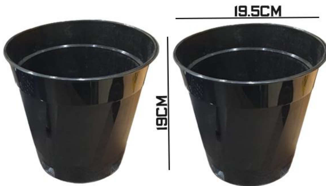
MODEL -: 15 COLOR -: BLACK