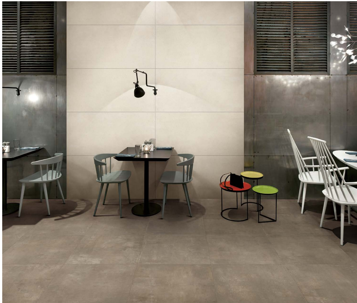
▲ 采用产品：九优纤维水泥板 Product used: juyou fiber cement board 场景：建筑内墙 Scene: Building interior wall